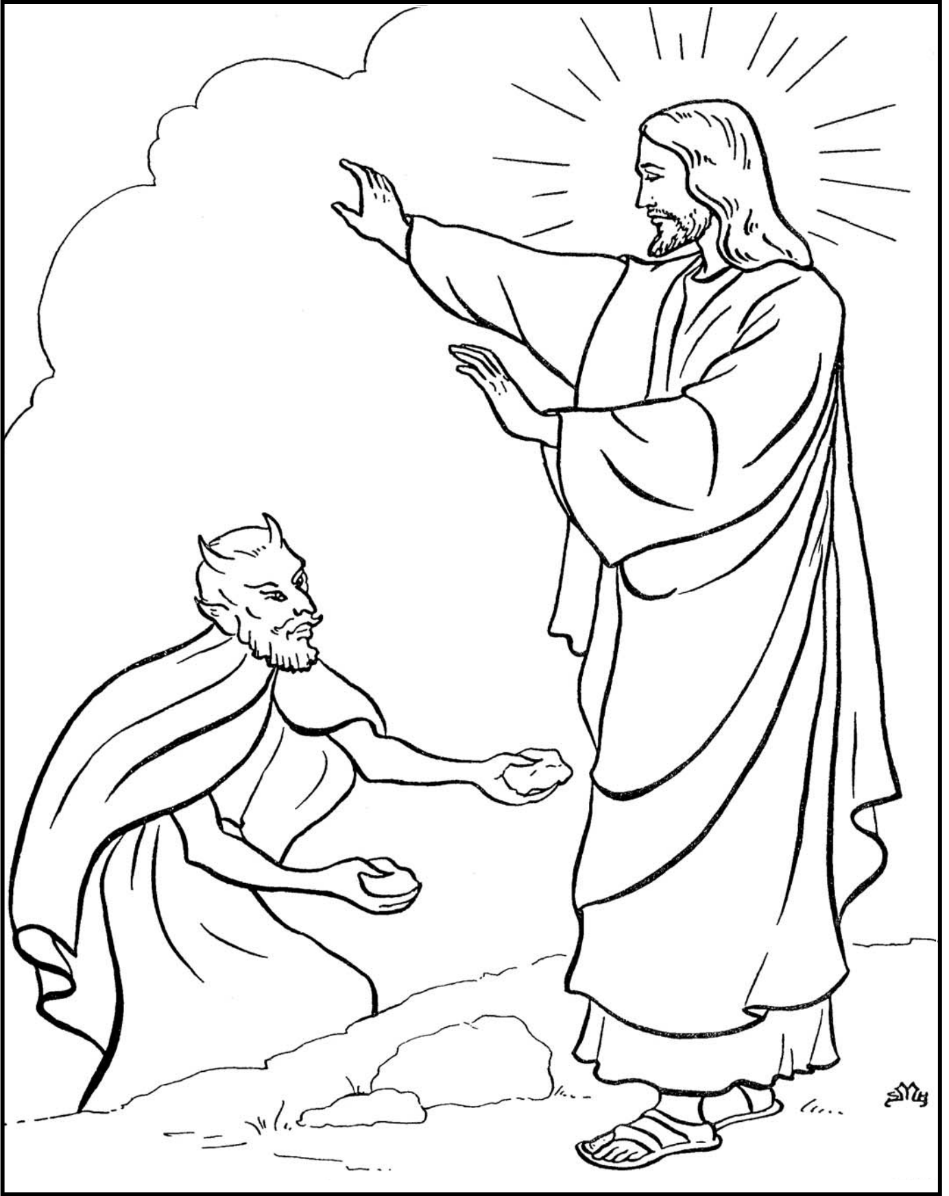
Satan tells Jesus to turn stones into bread.