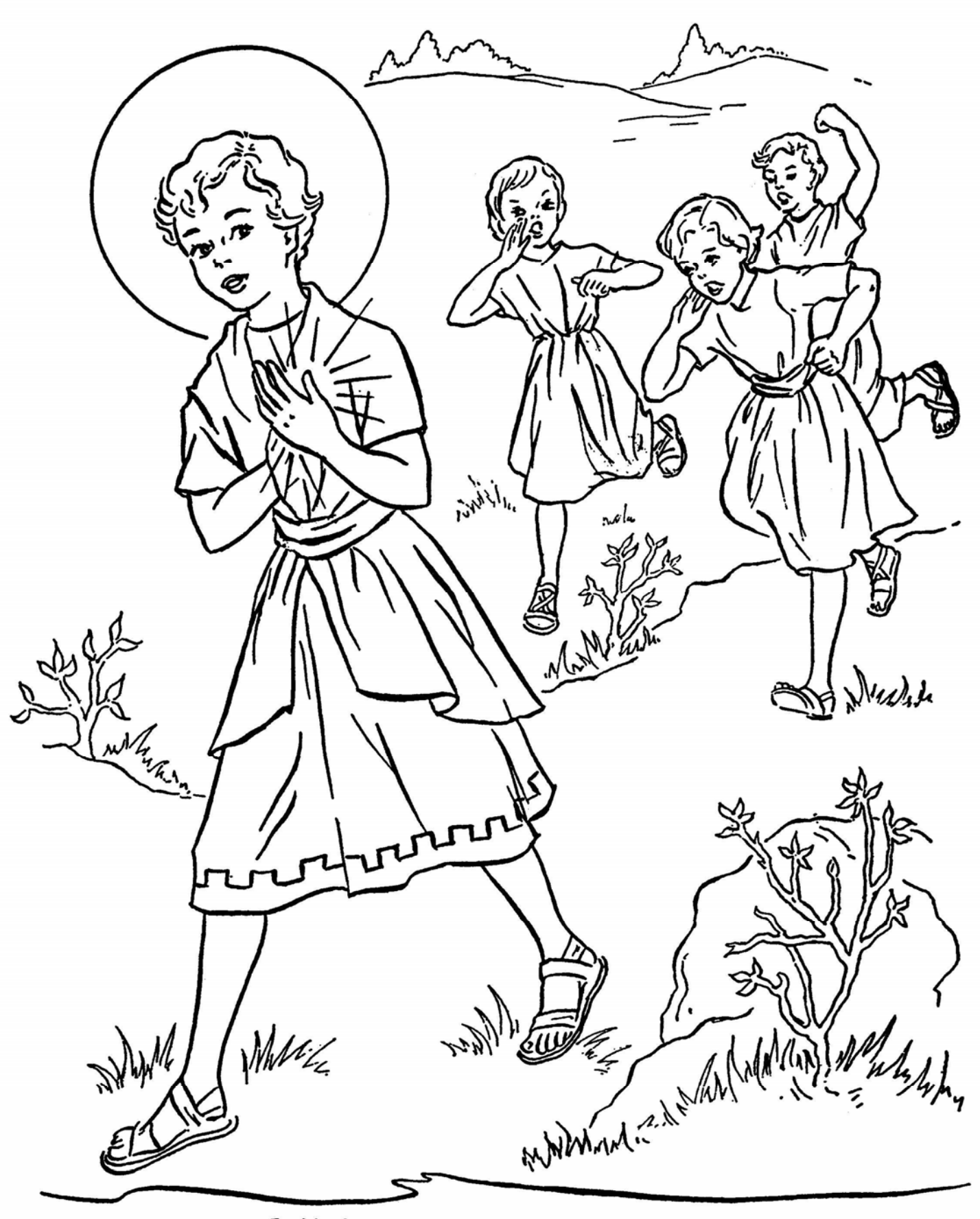
Tarcisius keeps his Treasure safe from the pagan boys.