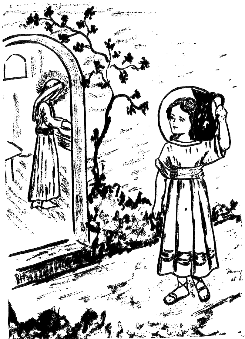
MARY AT HOME

Now don't you think Our Lady wants her little Marys to copy her? (Children's comments.) How fine it would be if each mother could say, "My, how I miss my little girl when she is not at home. I am glad when week-ends come and I can have her with me." (More comments.)