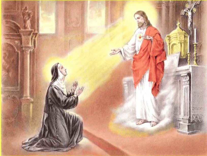
Jesus appeared to Saint Margaret Mary